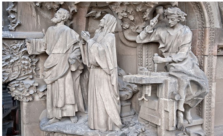
Jesus as a Carpenter behind Mary and Joseph, Sagrada Família, Portal de la Fe, Barcelona