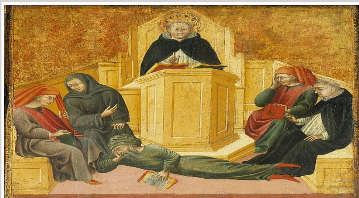
St Thomas Aquinas Confounding Averroes, by Giovanni di Paolo, ( Feeling Sleepy?)